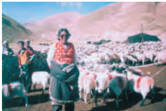
Nomad in Phala, Tibet

In year 05, each of the households who received a loan of sheep in Year 01, pays back the remaining 25 sheep they owe for a total of 100 sheep to the xiang. At the same time, each of the households who received sheep in year 02, pay back the first half