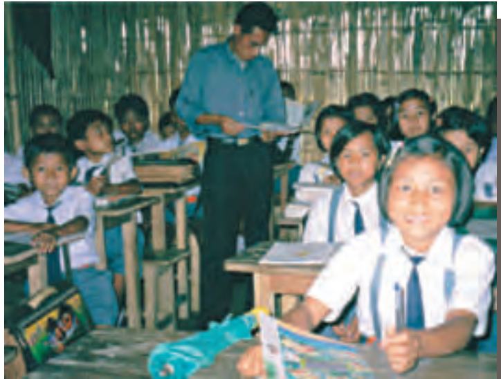
Students at the Chakma school in Arunachal Pradesh

One discrimination practised by AP state government officials was the consistent failure to forward Chakmas' legitimate applications for Indian citizenship. In 1996 the Indian Supreme Court ruled that this practice was illegal, affirming the right of Chakmas to be full Indian citizens. However, little has changed on the ground, except that overt violence has diminished. Clearly the Chakmas cannot rely on the Indian authorities to escape their poverty