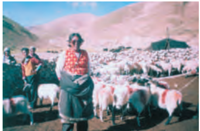
Nomad in Phala, Tibet

In year 05, each of the households who received a loan of sheep in Year 01, pays back the remaining 25 sheep they owe for a total of 100 sheep to the xiang. At the same time, each of the households who received sheep in year 02, pay back the first half