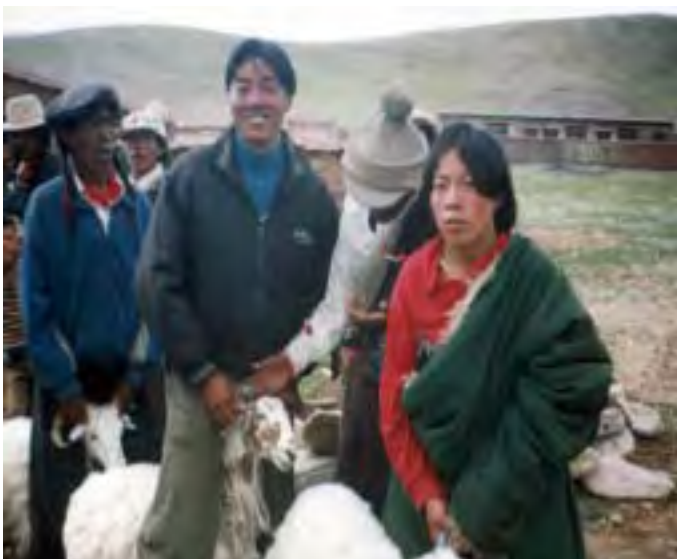
Revolving Sheep Bank, Year 3: See p. 4

Tibetan photos on pp. 1 & 4 courtesy Goldstein/Beall