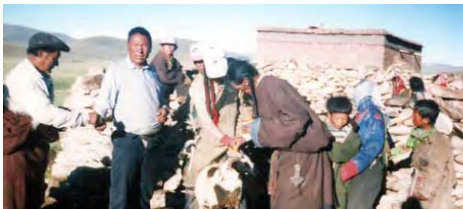
Revolving Sheep Bank, Year 3. Nomads receiving stock.