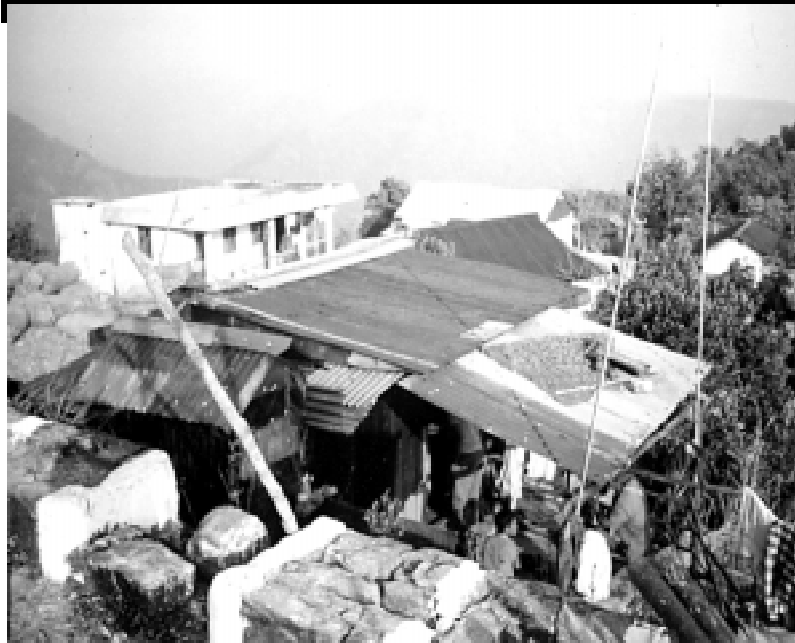
A house in the village of Sohbar

through the youngest daughter. Dr Ghonglah reports that there is no caste system. Men control all non-domestic work. Unlike the rest of Meghalaya, the area sometimes divides financial inheritance equally between men and women.